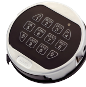
5750-K Round Entry