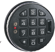
3125 Round Entry